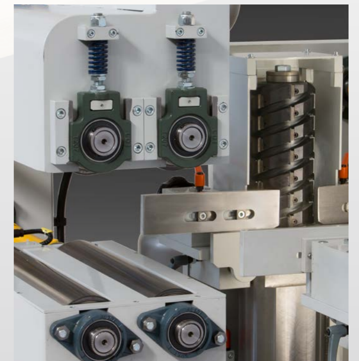
Hardened, chromed and ground feed rollers